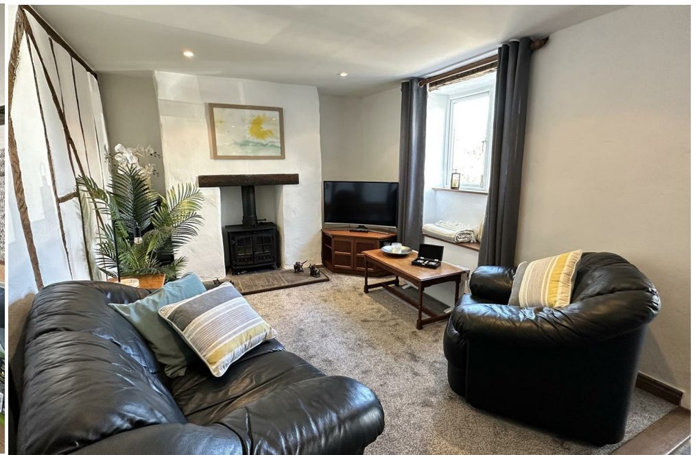
Greens Cottages, Trehan, Nr Saltash, PL12 4QJ